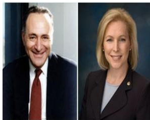
Chuck Schumer and Kirsten Gillibrand